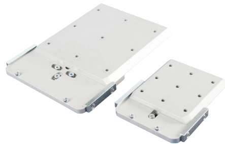
Wall bracket with quick-change plate