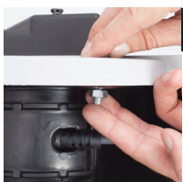
11 Undo the locking bolt on the pretensioned drum coil