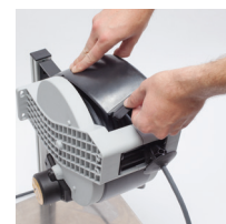
15 Insert the central guide pins by tilting the cover to the side and then pressing it into place