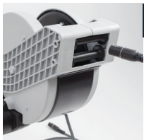
1 Feed the original SmartPAD cable through the guide rollers