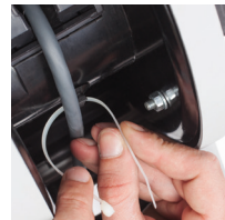
4 Fasten the cable tie around the outer sheath of the cable