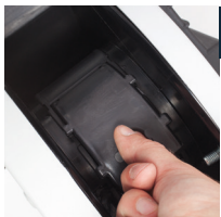
6 Insert the plug cover