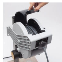
14 Place the cover on the attached cover guides at the rear