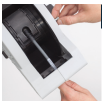
12 Be careful when removing the locking bolt!