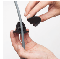
9 Attach the cable retraction stopper to the connector cable about 1 - 1.5 m from the SmartPAD