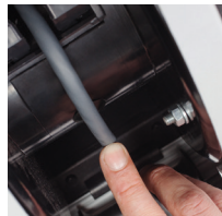
3 Adjust the strain relief cleat to suit