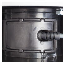
8 The cable as finally installed