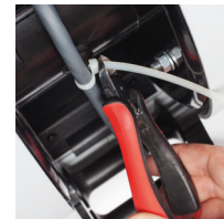
5 Trim off the excess cable tie