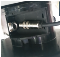
2 Plug the male cable end into the built-in female connector