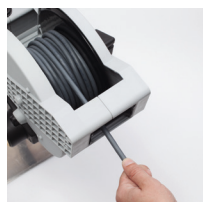
13 Manually wind the connector cable onto coil the first time