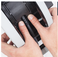
7 Lock the cover in place by applying pressure