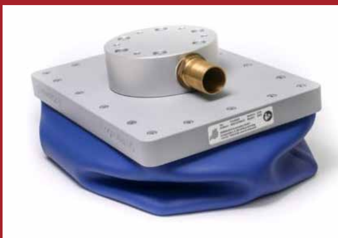
The FORMHAND replaces many product-specific solutions and thus saves energy, storage and maintenance costs.

3 Also in the packaging sector or in the order-picking of cardboard boxes, the FORMHAND performs reliably. There are no limits to flexibility here.