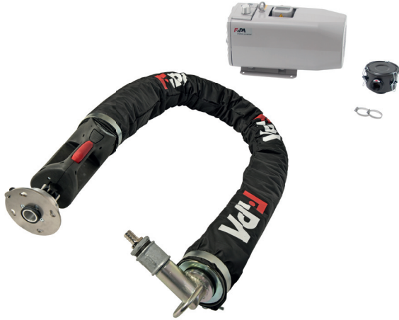
Set with rotary vane pump